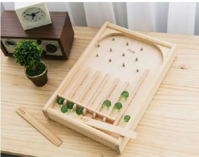
Taiwanese Pinball Machine The mini-size pinball machine is designed to play on table. Solid wood-made, exquisite and has good quality.

In order not to let father's wood factory fold up under the pressure of time and trends, the brother and sister from Taichung Houli, who have inherited their father's 26-years fine wood craftsmanship, inject elements of design, child fun and amusement into the traditional wooden crafts to develop a series of wood-based furniture, stationeries, supplies, illuminations, playthings, and kid's toys, giving a brand new appearance to the old fashioned wood materials. This is Taiwan's Carpenters. With a dream, with a sense of duty, the brother and sister bring in new design elements, new thinking and new creativities to the traditional declining industry and devote to Taiwan's local technique. Their devotions have opened up a brand new page for the industry that was considered lacking young people's support.